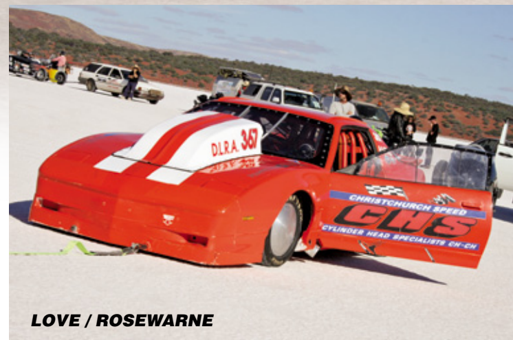
LOVE / ROSEWARNE