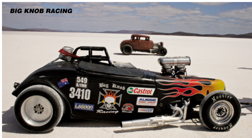
BIG KNOB RACING

limiter up by 1000 revs to 8500 revs. Mat keeps telling me "this motor will rev to 9000 all day long". After four records with a very reliable motor, and knowing how it sings at 200+ mph, I believe him and certainly willing to give it a crack – actually can't wait! We are also working on some weight balance changes. The roadster has always been very stable, we're hoping that further attention to the weights will keep that trend going at higher speeds. Higher speeds, that is, at about 232